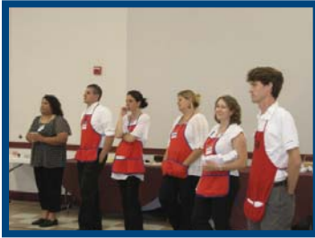
Child Advocacy Specialists working as wait staff

CASA celebrated our amazing volunteers with our Volunteer Appreciation Party on May 21. Almost 100 volunteers and their guests attended the event and our Child Advocacy Specialists were pleased to be the servers, thanking the volunteers for all of their service!